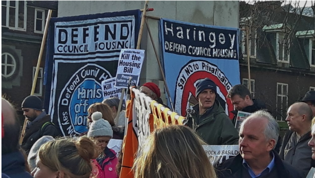
Protestors gather to defend social housing